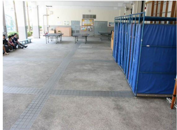
Fig. 1.6 Covered playground in school