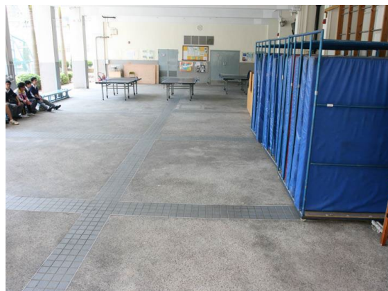
Fig. 1.6 Covered playground in school