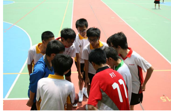
Fig 1.2 Participating in co-curricular activities strengthens participants' social and communication skills.