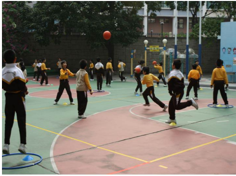
Fig 1.1 Taking part in physical activities helps students develop collaboration skills, creativity and problem-solving skills.