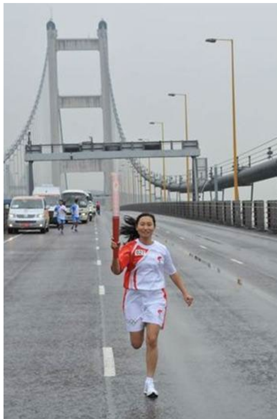
Fig 1.4 The Beijing 2008 Olympic Games raised global attention. It helped China build a friendly image and promote its legacy worldwide.

Many people think that sport should not be involved in politics. In reality, large-scale international sports events have been a platform for some countries to showcase their power, create an image of goodwill or leadership, and promote collaboration with other countries as well as mutual understanding among people from different parts of the world. International sports events are often an avenue for diplomatic activities such as political negotiations, expressions of protest or even threats.