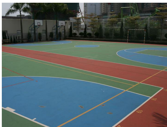
Fig. 1.5 Open playground in school

C.1.4 Facilities and equipment - The majority of schools have an open playground, a covered playground and a hall. They are equipped with basic equipment for PE or related co-curricular activities. Schools may apply for the use of public or community facilities, including sports grounds, swimming pools, sports centres, hard-surfaced recreation grounds, grass and artificial turf pitches, tennis courts, squash courts and so on to conduct PE and related co-curricular activities. Most of these facilities are managed by the LCSD, the Housing Department or private, regional or district sports associations.