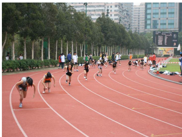
Fig. 1.7 Public sports facilities – sports ground