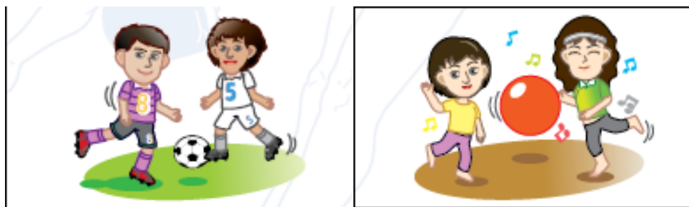
Fig 8.2 Gender influences the choices of physical activities