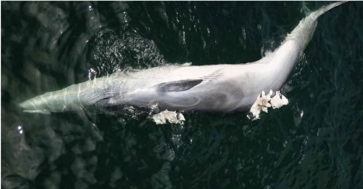
The Bryde's whale was found dead on Monday in Sai Kung.